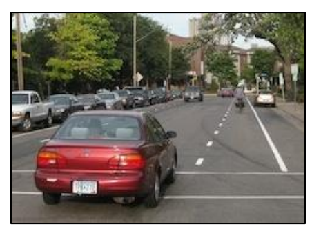
TRADITIONAL BIKE LANE ON MOORS ROAD IN PROVINCETOWN (L) AND AN "ADVISORY" BIKE LANE IN MINNEAPOLIS (R).