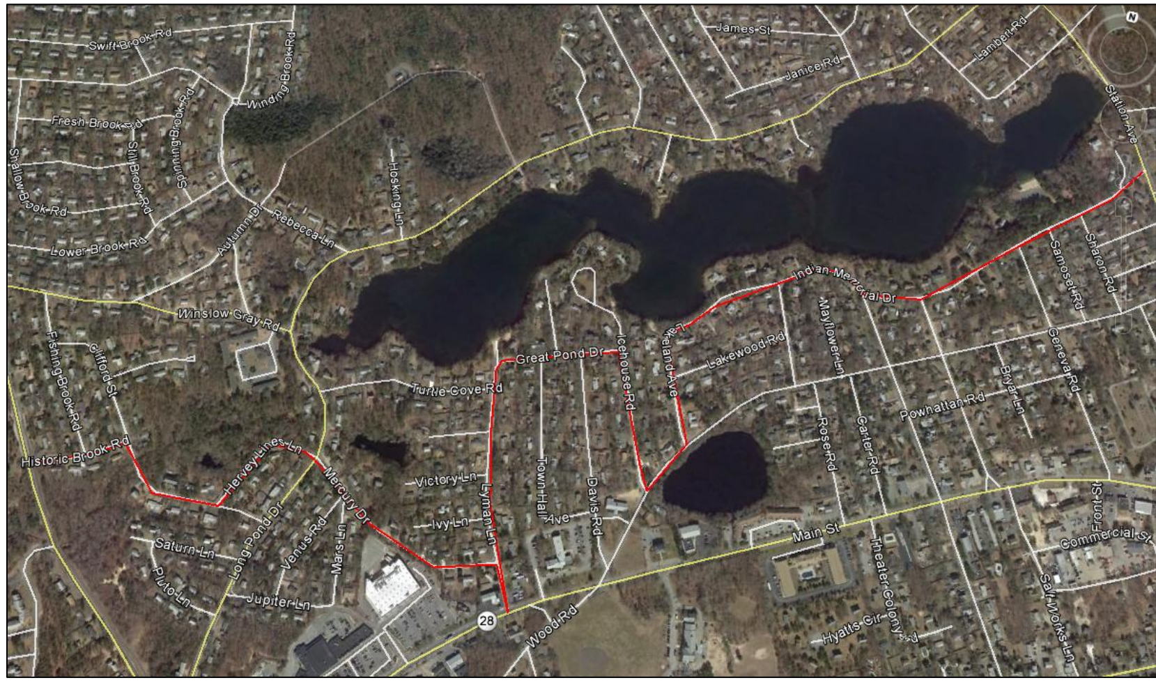
RED LINE SHOWS CONNECTIONS FROM FOREST ROAD BIKE PATH/HISTORIC BROOK ROAD TO STATION AVE BIKE ROUTE SEGMENT THROUGH NEIGHBORHOO STREETS (SEE EXISTING NETWORK AND PROPOSED CONNECTIONS ON PREVIOUS PAGE.