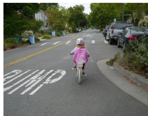
BIKE BOULEVARDS IN BERKELEY, CALIFORNIA<sup>5</sup>