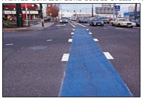
CYCLISTS' TRAVEL SPACE TO MOTORISTS.

PAINTED CONFLICT ZONE GUIDES CYCLIST PLACEMENT ACROSS INTERSECTION AND HIGHLIGHTS